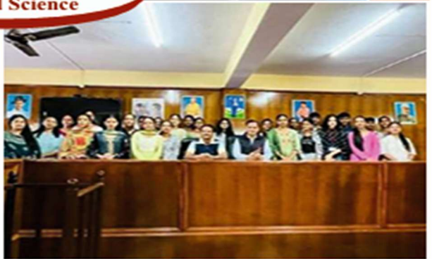
Collection of World Students Day, Department Visit & Study Tour