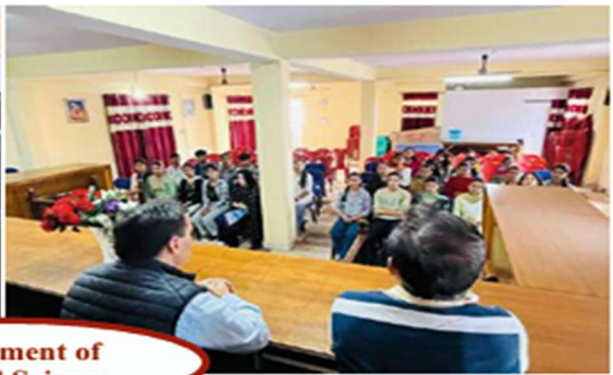
Department of Political Science